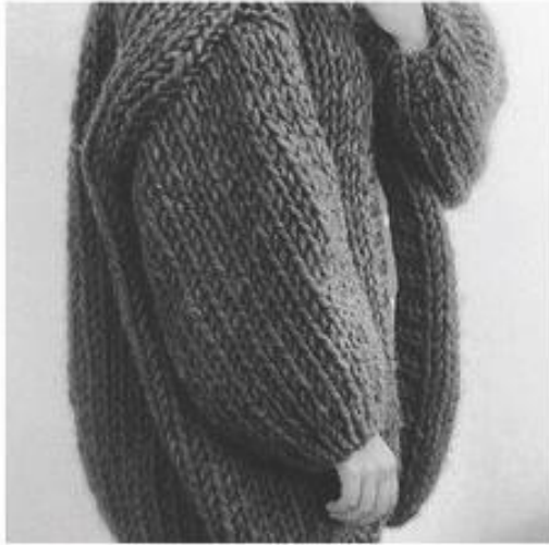
saving energy by wearing layers